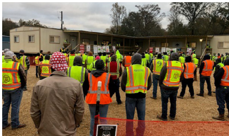
Morning "all hands" meeting where workers receive daily safety information prior to starting any work on the project.