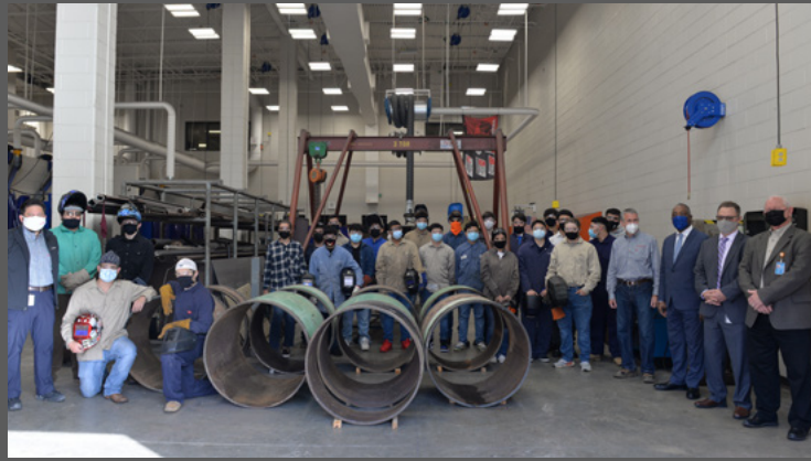
Excess pipe donation to La Porte High School Career and Technical Education program.

Because welding is a specialized trade in pipeline work, ExxonMobil Pipeline Company is always looking for opportunities to support students who choose to pursue this career. Recently, we donated excess pipe segments from a nearby project to La Porte High School's Career and Technical Education Program. Student welders will now be able to practice their trade on several tons of specialized steel.