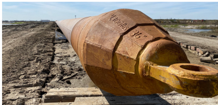
The two-ton reamer that cleared the pipeline path dozens of feet below the Ship Channel.

ExxonMobil Pipeline Company completed the process of installing two new pipelines under the Houston Ship Channel. The work took place between an unincorporated industrial area of East Harris County and Bayway Dr. in Baytown. Safety was the main priority as work was being conducted. To learn more about the process, refer to our Horizontal Directional Drilling fact sheet at harris.exxonmobilpipeline.com/resources.aspx .