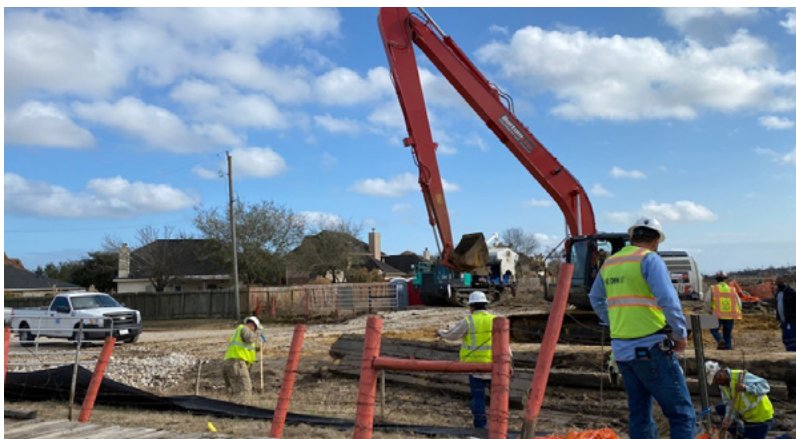
A crew in La Porte working on weld tie-ins.