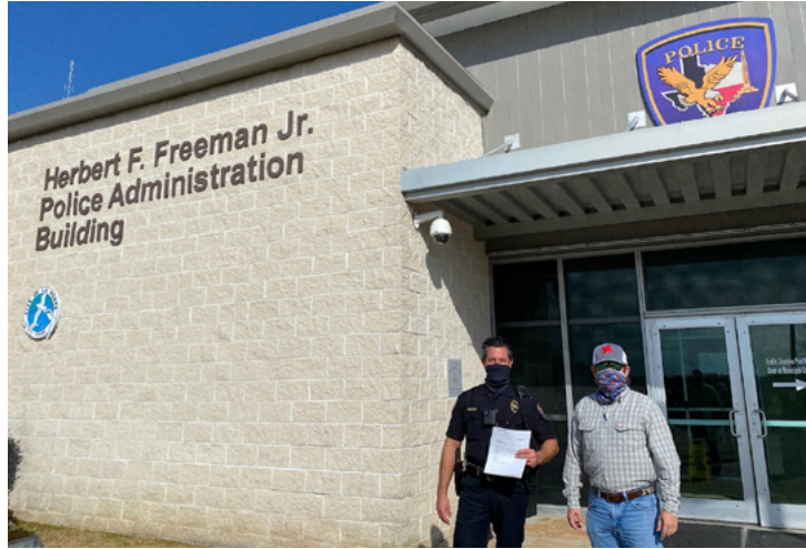
Hand sanitizer donation in Harris County. (top) Good Neighbor Grant awarded to La Porte Police Department. (bottom)