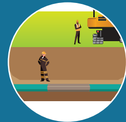
Hi-Grade Steel & Protective Coatings